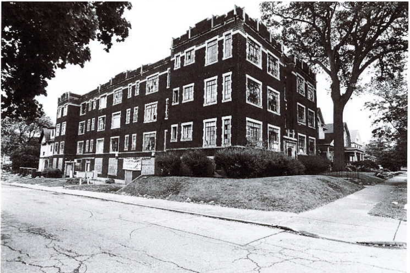
The Lincolnshire Apartment building at 12th and Lincoln streets in Anderson.